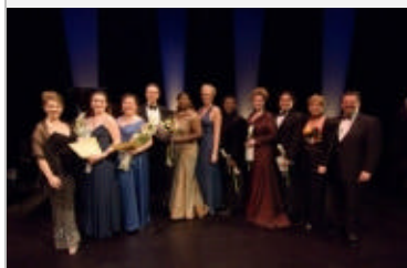
18th Annual Eleanor McCollum Competition for Young Singers